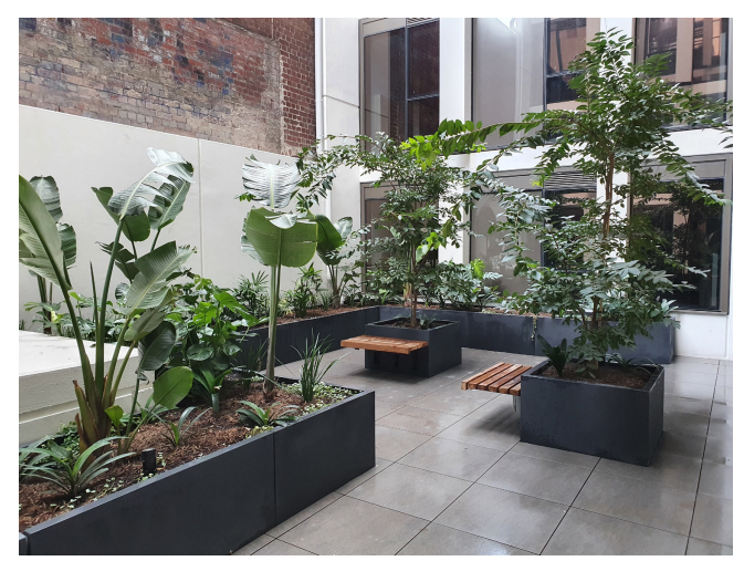
PHOTOS OF A SATU BUMI INSTALLATION OF GRC PLANTERS WITH ADJOINING LOWERED WALLS