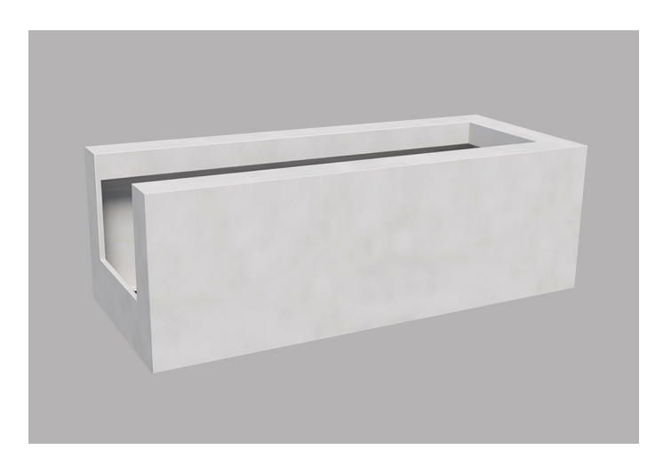
LOWERED WALLED RECTANGLE GRC PLANTER

This lowered wall approach can also be used when segmenting very large rectangle or round planters so that the segments can be manufactured off site, easily transported, then joined (which depending on the design, may include bolts), grouted and sealed on site for water proofing.